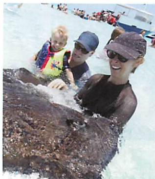
2016 Disney Cruise swimming with the Stingrays on Grand Cayman Island.